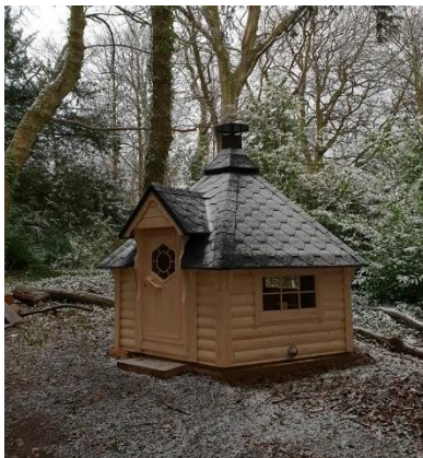
The new Clondeboye Nature Rangers barbecue hut ideal for those really cold afternoons

Schools and groups will visit Mount Stewart Demesne on six separate occasions. On completion of the six weeks participating organisations will have the option to become trained as a Forest School themselves.