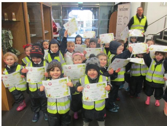
Little Flower Nursery receiving their Nature Ranger Certificates at Ranfurly House in Dungannon

NIFSA is a small independent charity and we rely on funding from the Dufferin Foundation, local Councils, Public Health Agency and the Drumlin Wind Co-Operative. These pots of money are hugely important, and we thank our sponsors, but we need to work in becoming self-sustaining. If all our registered Forest Schools became members, this would go a long way to making this a reality.