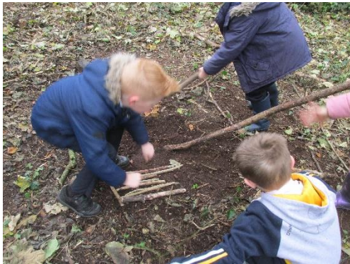
Pupils from St Joseph's Primary School in Crumlin visit Crumlin Glen thanks to the Forest School Awards supported by Antrim and Newtownabbey Council.

Don't forget if you are not in you cannot win!