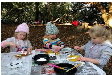
Making scary ghosts from sycamore leaves at Clondeboye

The Clondeboye Nature Rangers is an after-school club for North Down. It is proving very popular and kids are really enjoying it.