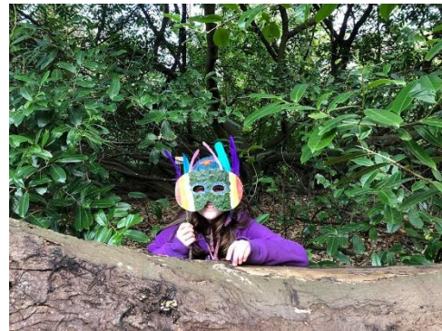
A spooky mask for Halloween!

We organised Clondeboo – the Halloween Holiday Programme between 29 th Oct – 2 Nov. Places filled up quickly and we had lots of great activities – cooking on the fire, spooky crafts, nature walks, den building and lots more.